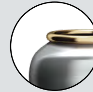
SCHRÄGSCHULTER FLAT SHOULDER