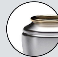
RILLENSCHULTER RIM SHOULDER