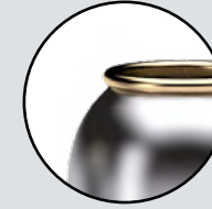
OVALSCHULTER OVAL SHOULDER